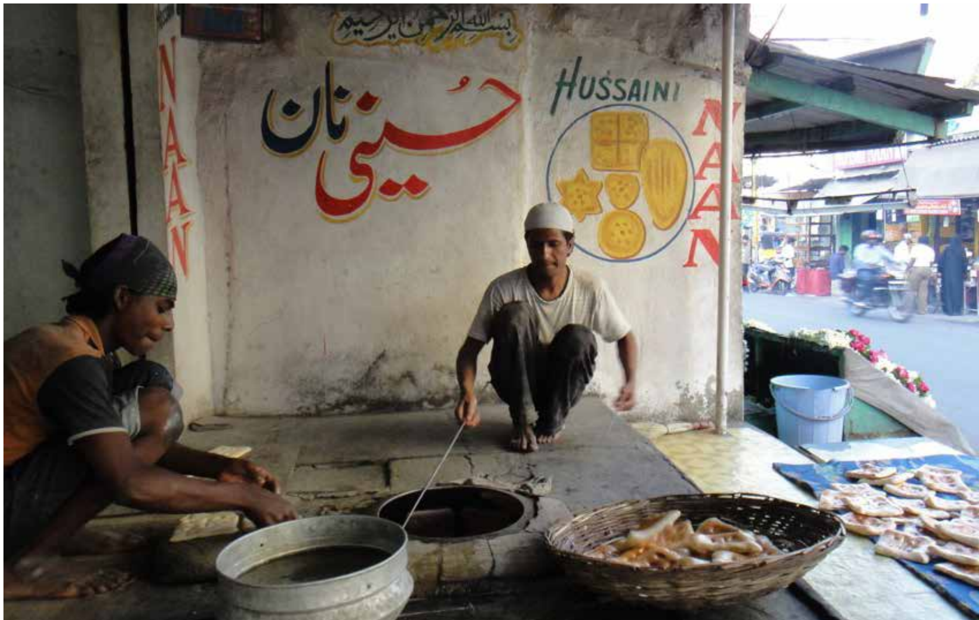
Photos of the Old City – Hyderabad, India