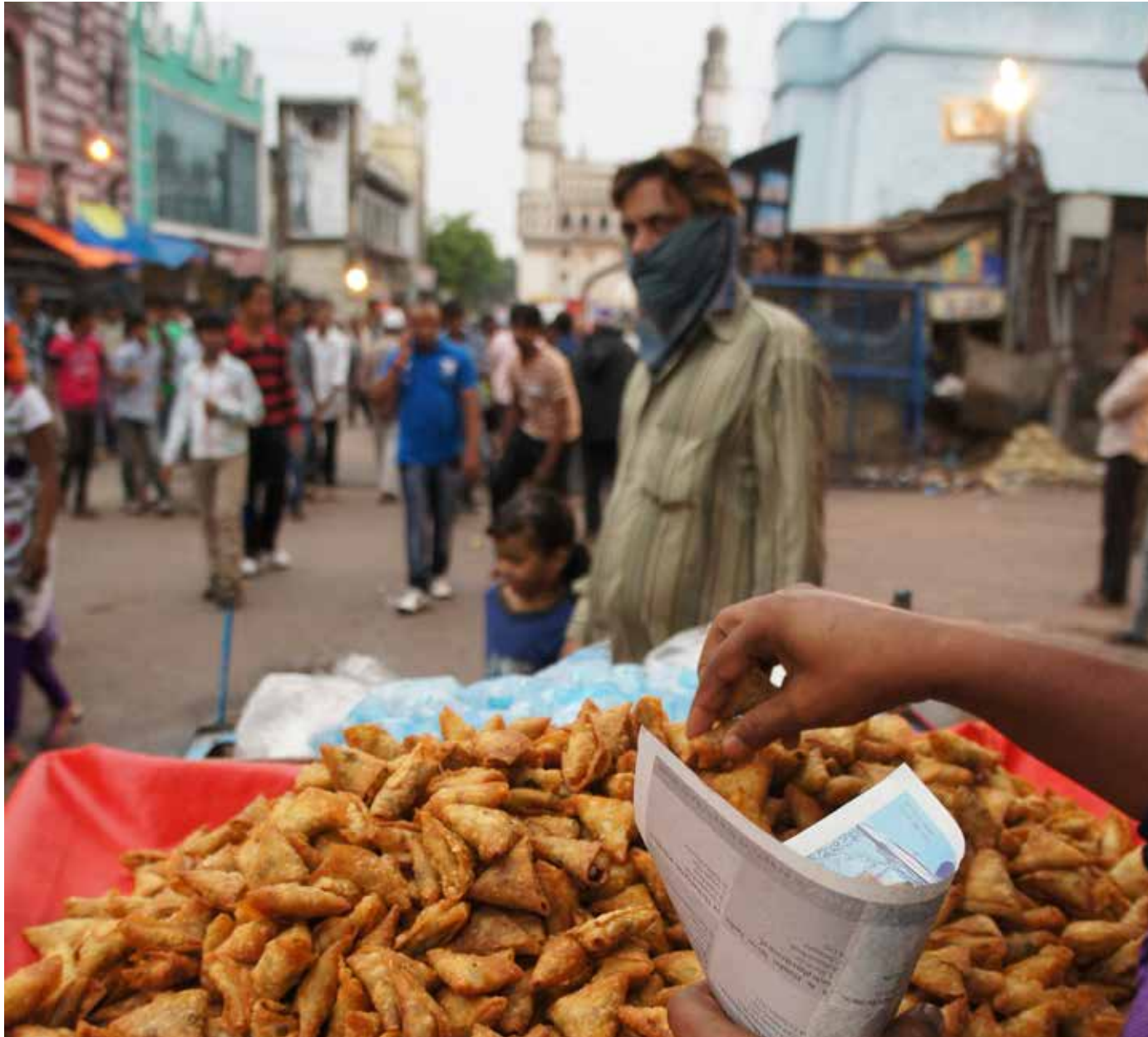
Photos of the Old City – Hyderabad, India