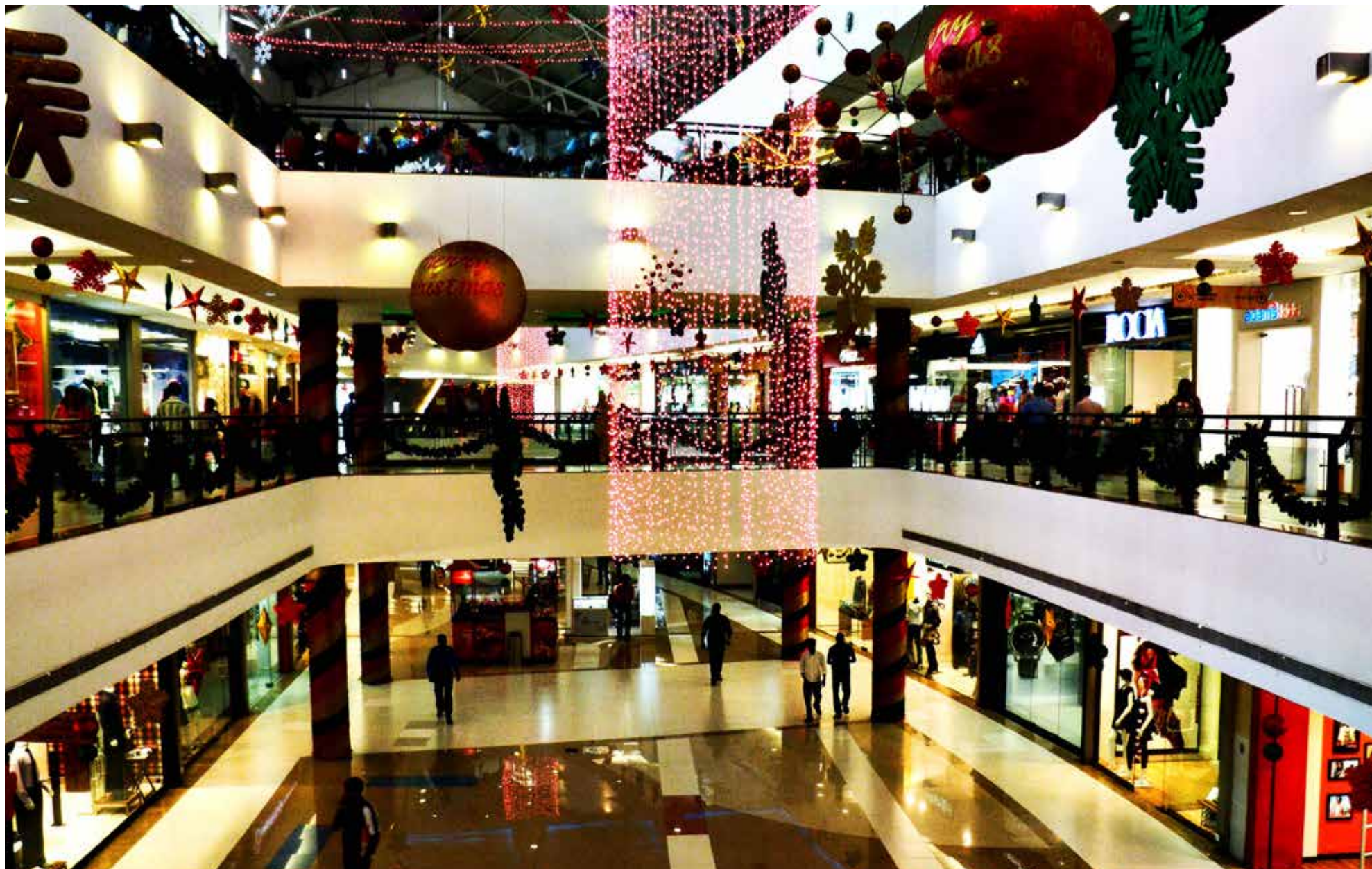
Photos of the Hi-tech City and shopping malls