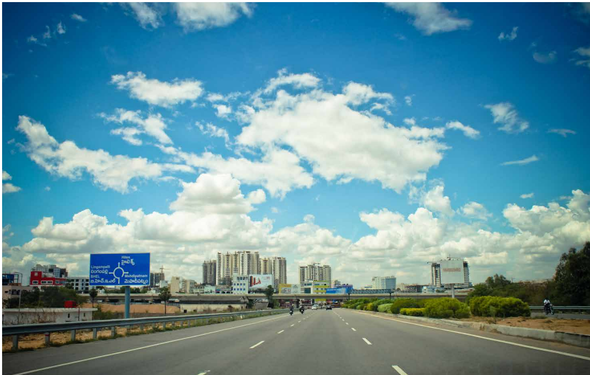
Photos of the Hi-tech City and shopping malls