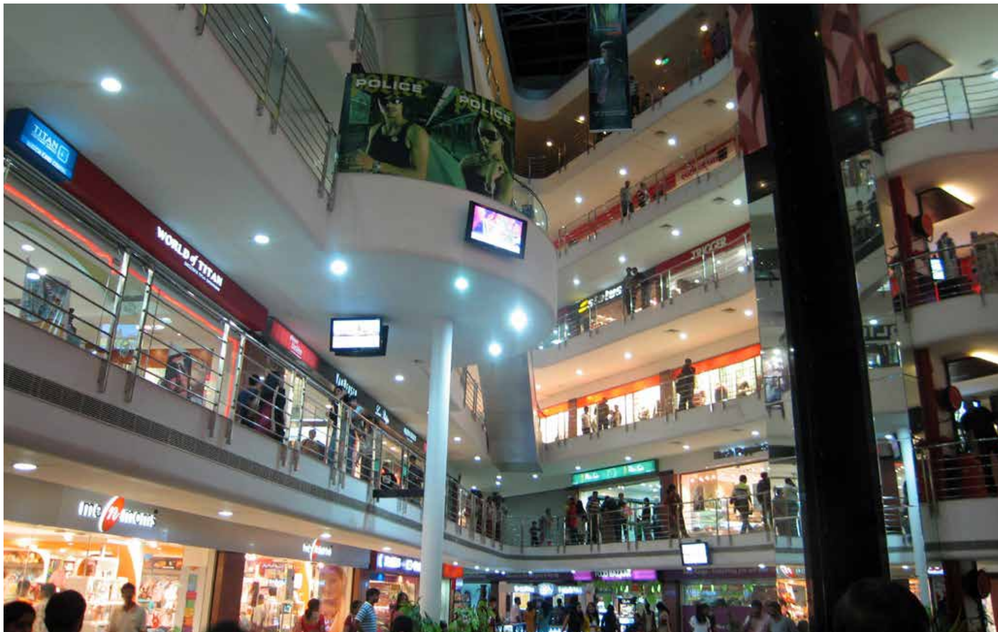
Photos of the Hi-tech City and shopping malls