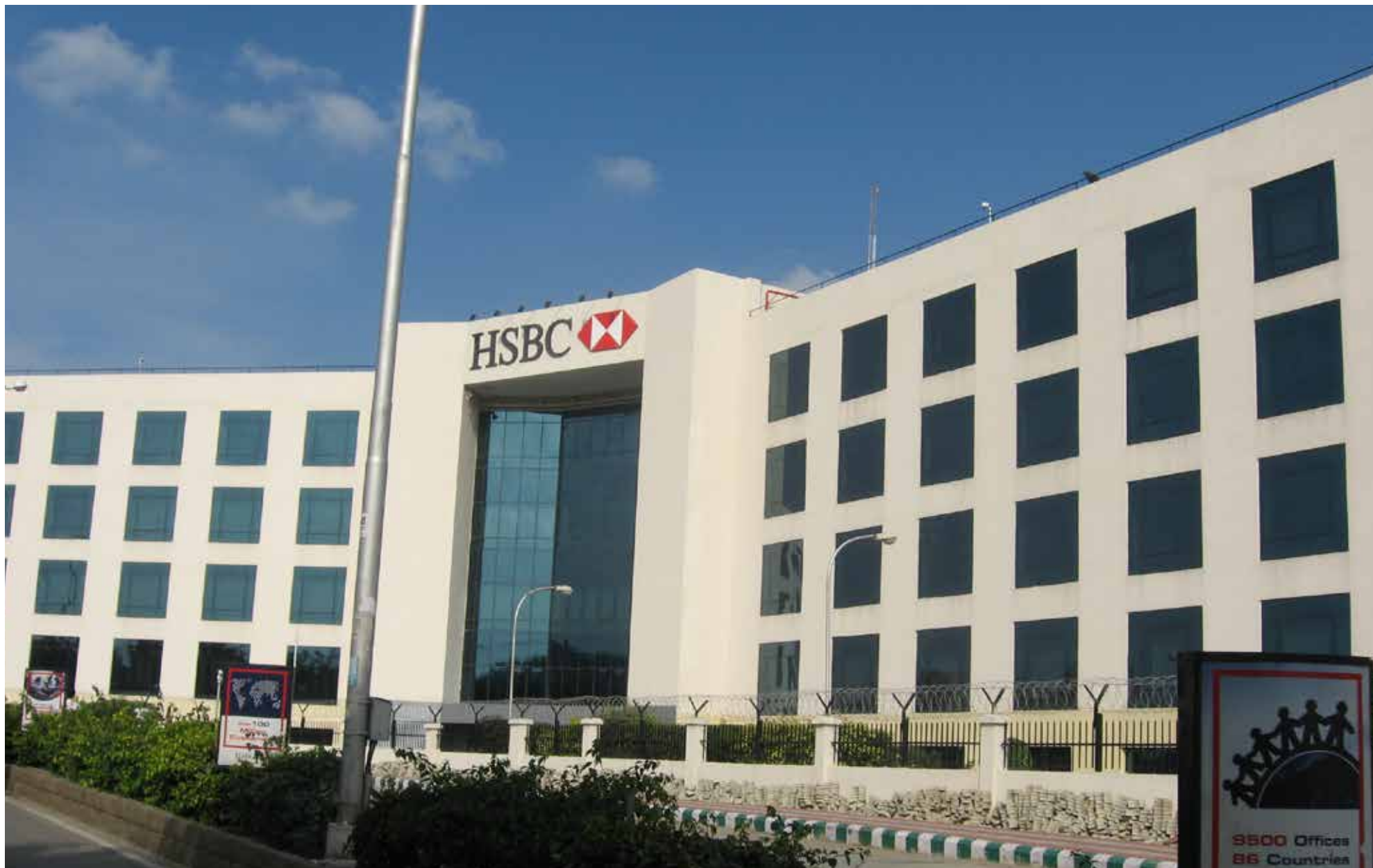
Photos of the Hi-tech City and shopping malls